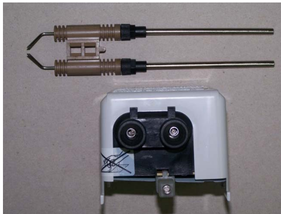
Part # 380788

Thank you, for your cooperation in this matter. Should you have further questions, please contact Thermo Pride Customer Service at 800-348-5130.